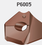
P6005 WKK45C ideal for cast irons (ISO K)