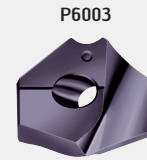
P6003 WMP35 ideal for stainless and super alloys (ISO M and ISO S)