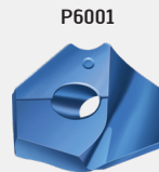
P6001 WPP45C ideal for steels (ISO P)