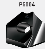
P6004 WNN25 ideal for non-ferrous materials (ISO N)